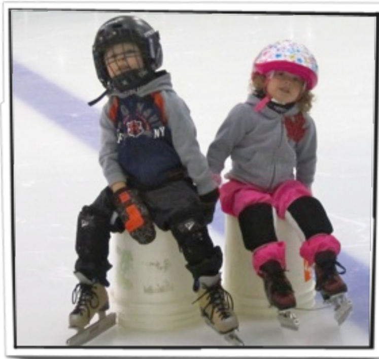
Two skaters from the Ridge Meadows “Learn to Skate” Program in August, take a break from the rigors of training.