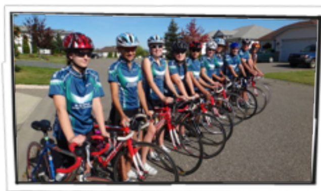
Some of the Competitive skaters cycled for their off season training.